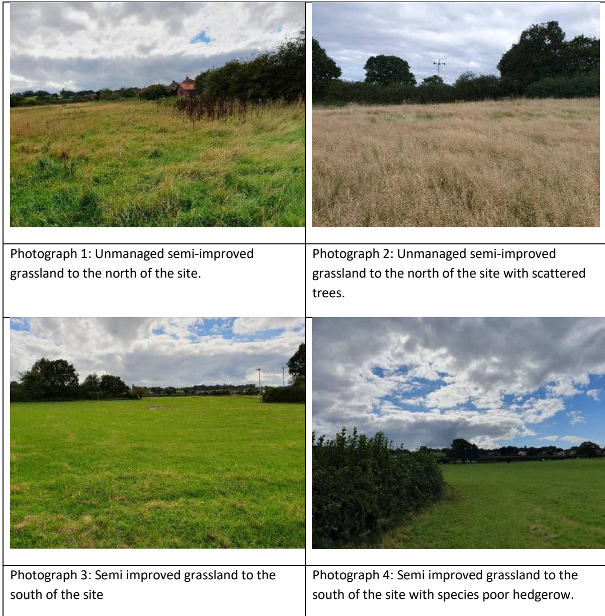
Table 3: Photographs of the site