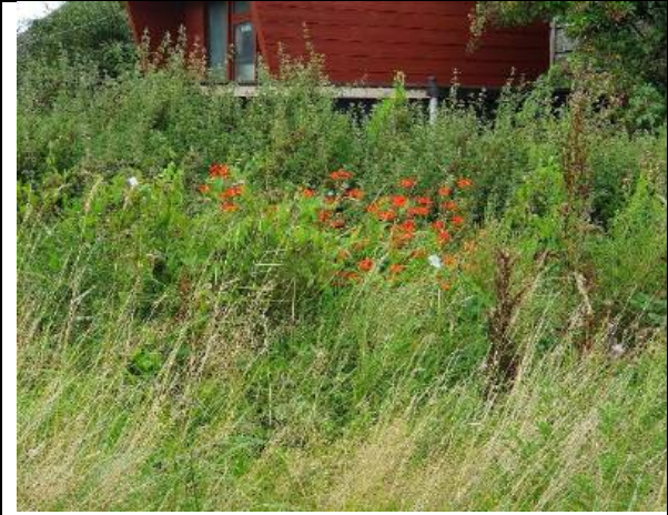
Photograph 5: Montbretia (TN1) with tall ruderal vegetation