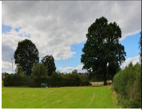
Photograph 6: Scattered trees