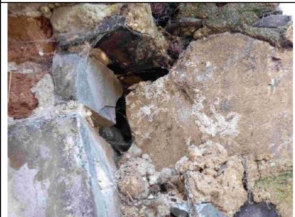
Photograph 17: Gaps in between stonework of B5