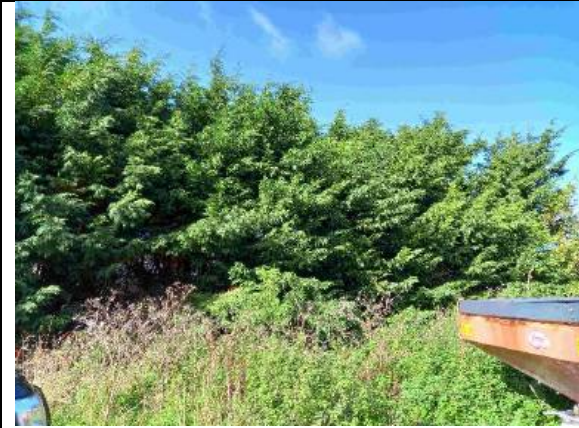
Photograph 31: Line of scattered trees