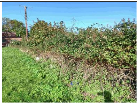
Photograph 34: Species poor hedgerow that lines the eastern site boundary