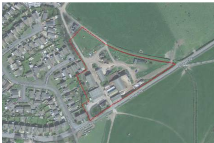
Photograph 1.1: Extent of site

Ascerta has been instructed by Castle Green Homes to carry out a Preliminary Ecological Appraisal and Daytime Building Inspection of Land off Gronant Road, Prestatyn (hereafter referred to as the site). The site OS grid reference is SJ 077 831 and the What3Words reference is nets.incisions.landlords. The extent of the site is displayed in photograph 1.1 below.