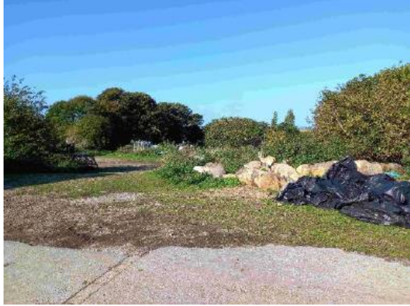
Photograph 37: Short perennial/ephemeral vegetation