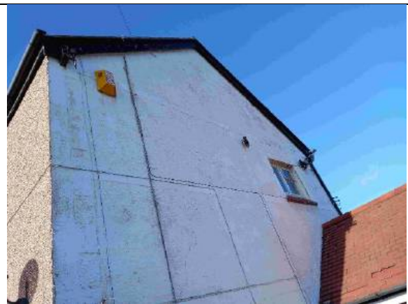
Photograph 4: Eastern elevation of B1. Large gaps present between facias and walls