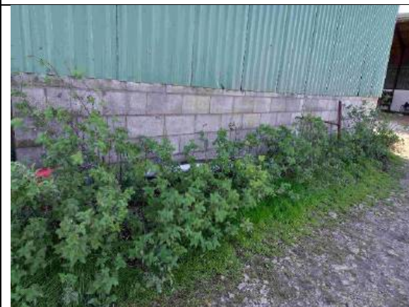
Photograph 35: Tall ruderal encroaching hardstanding