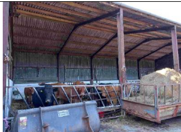
Photograph 18: Building B6