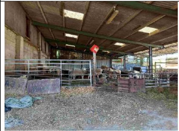
Photograph 15: Eastern elevation of B4