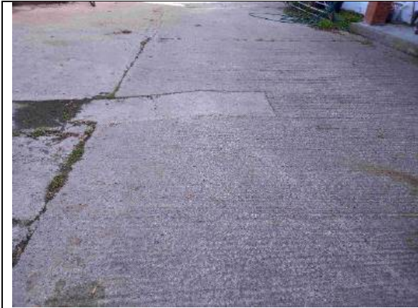
Photograph 1: Hardstanding concrete farmyard