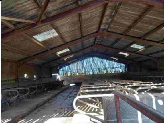
Photograph 25: Building B9 internal