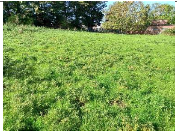
Photograph 30: Semi-improved grassland within south of the site