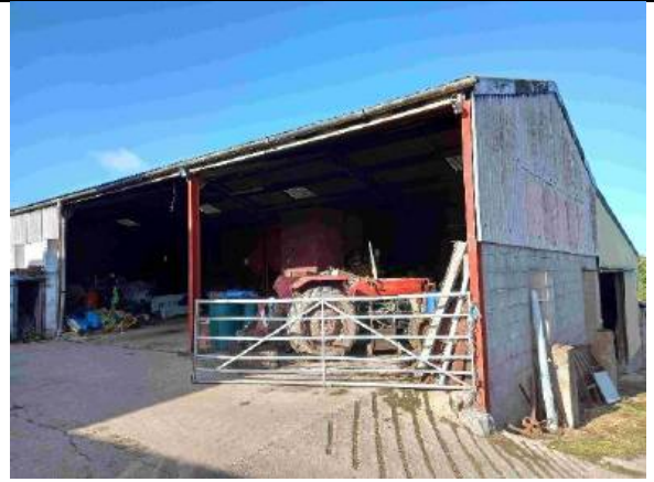
Photograph 14: Southern elevation of B4