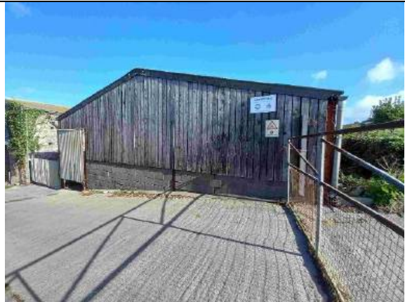
Photograph 6: Broken facias and cracks in render on B1