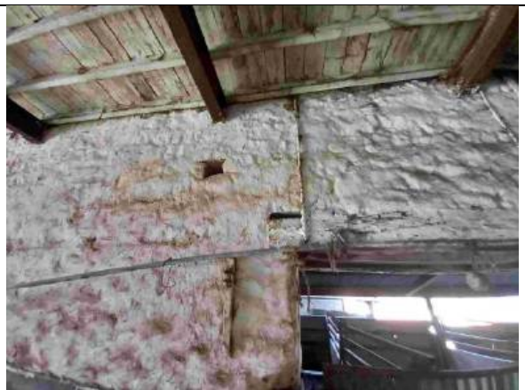
Photograph 10: Western elevation of B3