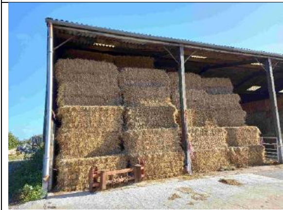
Photograph 21: Building B7