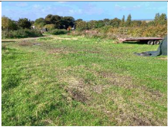
Photograph 29: Semi-improved grassland within the east of the site