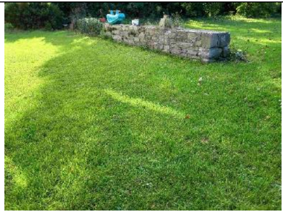
Photograph 28: Semi-improved grassland south of B1