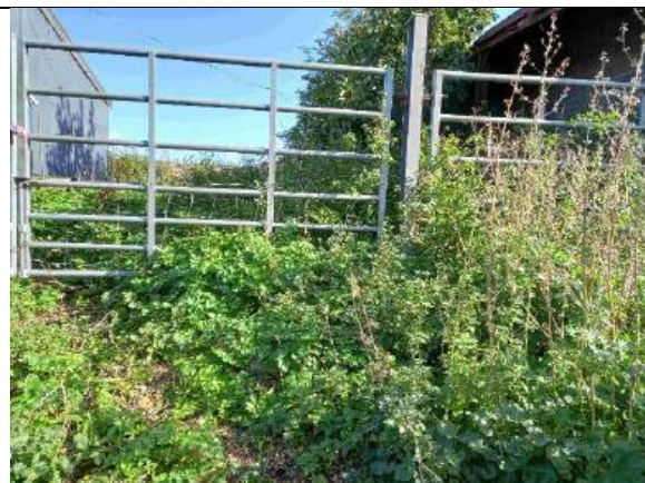
Photograph 36: Tall ruderal throughout the site