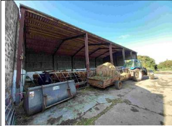
Photograph 19: Eastern elevation of B6