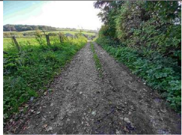
Photograph 2: Hardstanding vehicular track