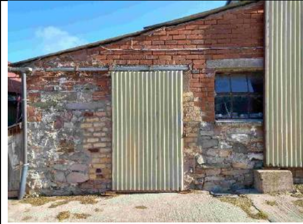
Photograph 13: Sloped brick extension off northern elevation of B3