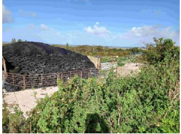
Photograph 38: Tire pile (TN1)