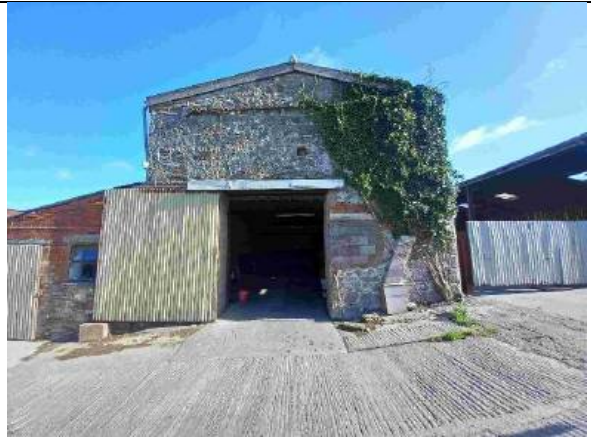
Photograph 8: Eastern elevation of B2