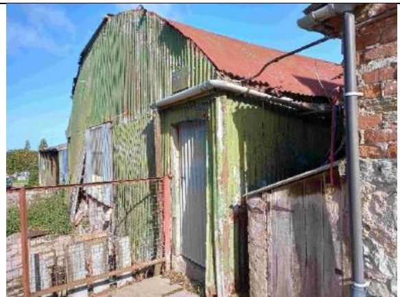
Photograph 22: Building B8