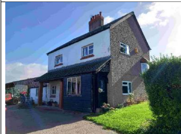
Photograph 3: Northern elevation of B1