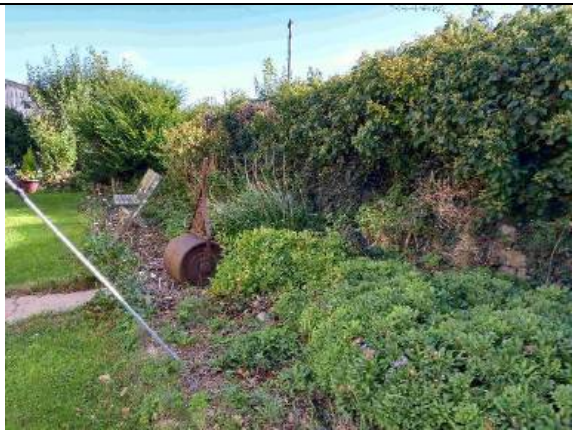
Photograph 27: Introduced shrubs that border residential garden