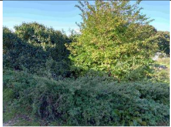
Photograph 32: Scattered trees