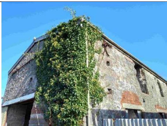
Photograph 11: Ivy clad corner of B3