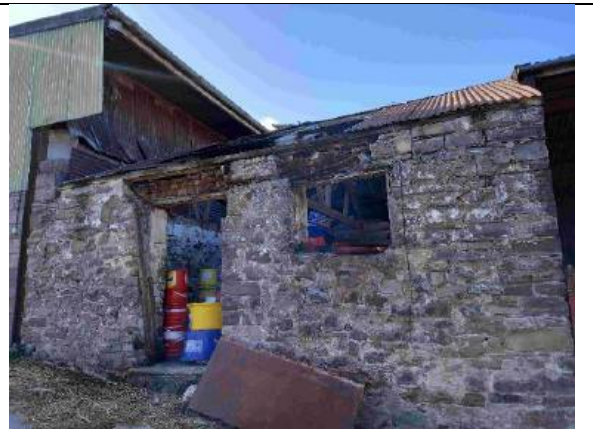
Photograph 16: Building B5