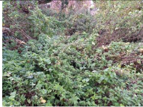
Photograph 26: Scrub west of buildings B4 and B6