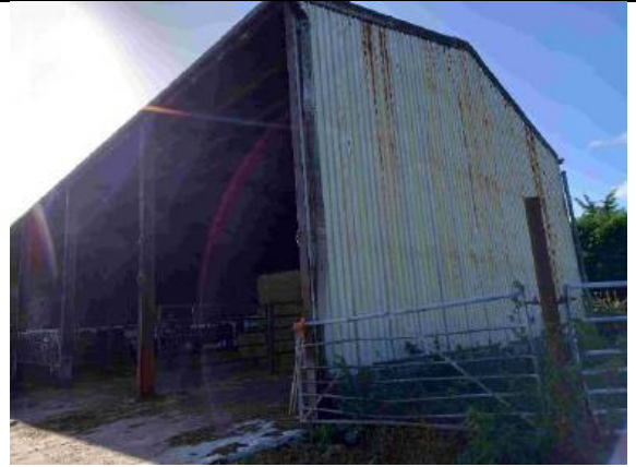
Photograph 20: Southern elevation of B6