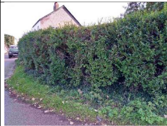
Photograph 33: Species poor privet hedgerow