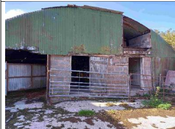
Photograph 23: Eastern elevation of B1