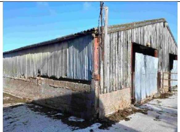
Photograph 24: Building B9